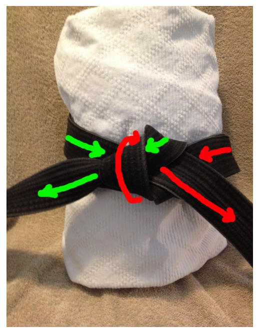
Pull the red end to your left as you pull the green end to your right to tighten the knot. You can also grab the top layer of the wrapped belt, behind the ends, and pull away from the knot [opposite direction of the arrows shown] to further tighten your belt [obi].