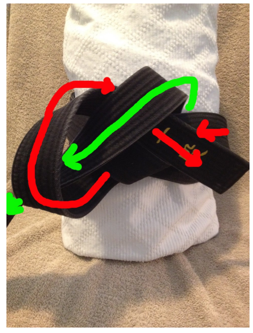
The red end of your belt goes over the green end and down through the loop created, with the red end going to your left.